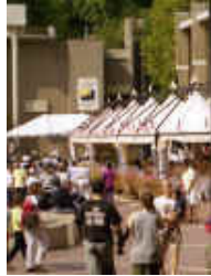
Lake Anne Plaza